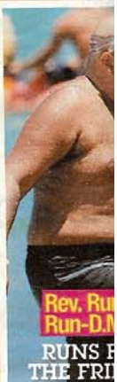
Rev. Run Run-D.M.C. RUNS F THE FRI

JULY 14, 2008 $3.49 US / $4.79 Canada 2 8 >